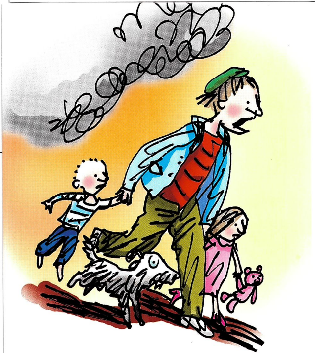
fi re , fi re !

3. to ad , o ak , ro ad , clo ak , thro at , ro ast , to ast , lo af , co at , co al , co ach