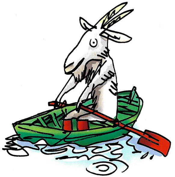
go at in a bo at

3. to ad , o ak , ro ad , clo ak , thro at , ro ast , to ast , lo af , co at , co al , co ach