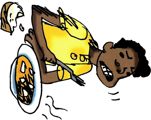
che w the ste w

3. su re , pu re , cu re , pi c tu re , mi x tu re , crea tu re, fu tu re, ad ven tu re , temp er a tu re