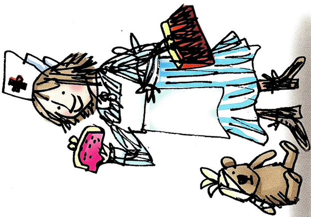
nurse with a pur se