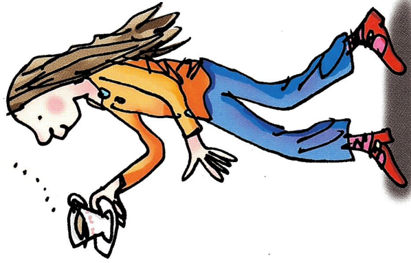
cup of tea