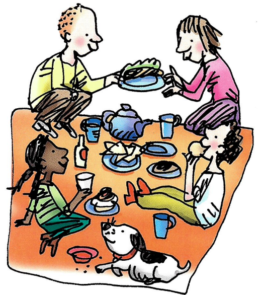
care and share