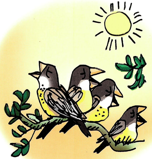
yawn at dawn