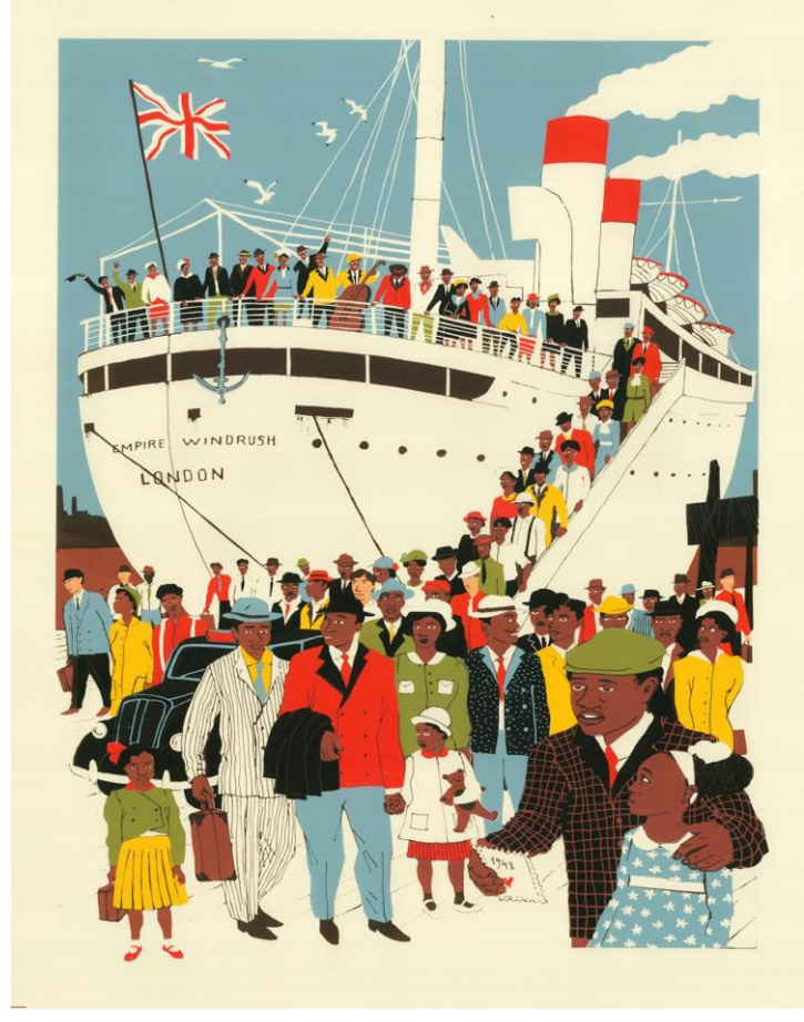
Fruit sculptures in Hackney to honour Windrush generation