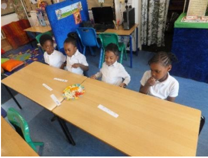
Tasting experiment in Year 1