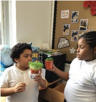
A comparative test to explore the survival needs of plants in Year 3