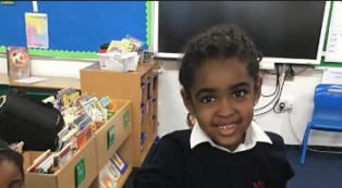
Blubber experiment in Year 2