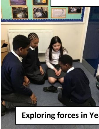
Exploring forces in Year 5 with Newton-metres