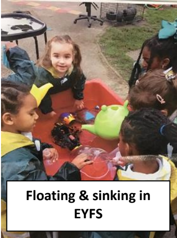
Floating & sinking in EYFS