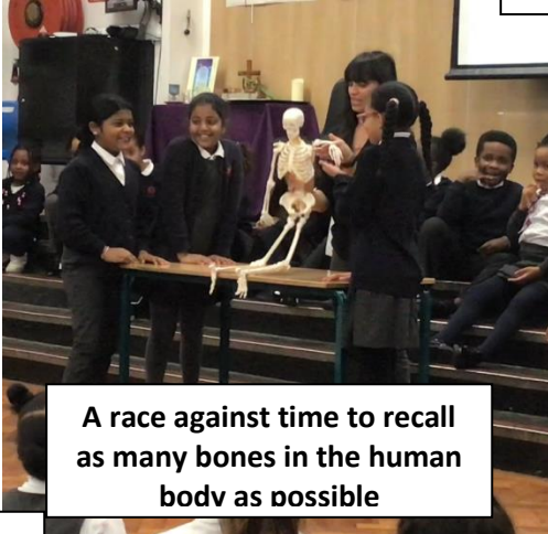
A race against time to recall as many bones in the human body as possible