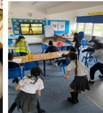
Year 3 cultural awareness: Learning how to dance the salsa. Grammar: learning phrases about the city of Malaga in Spain.