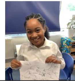
Year 6 Cultural awareness, speaking, listening and writing: Sampling Spanish Tapas including Manchego cheese, bread and olives. Giving opinions and writing reviews in Spanish. Presenting ideas orally to an audience.