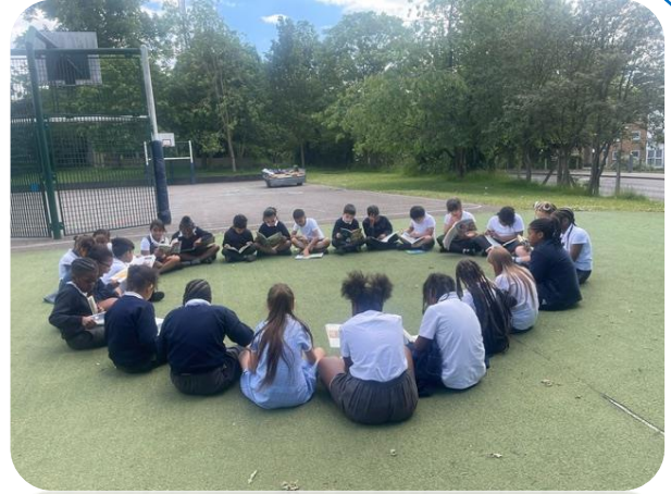
Year 3 spent time in the Open Library and outside, creating and performing poems.