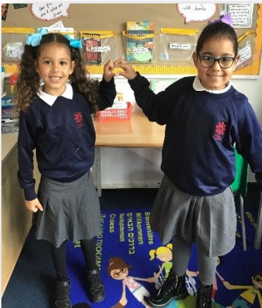
Year 2 Hummingbirds

"What does the Lord require from you, but to do justice, love kindness and to walk humbly with your God." (Micah 6:8)