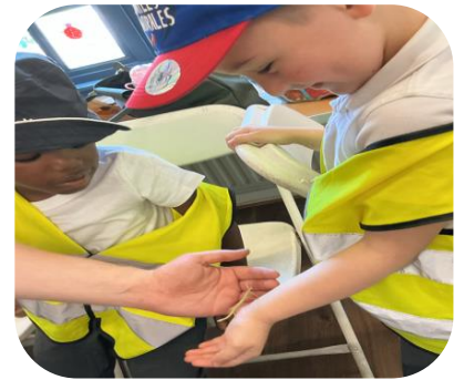
They had fun with a stick insect too!