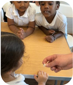
The life cycle begins with a tiny egg

EYFS enjoyed their fabulous trip to Deen City Farm on Thursday. The weather was lovely, it was sunny and bright. They enjoyed a workshop about the life cycle of a butterfly, they got to see the egg, caterpillar larva and the chrysalis. They also had fun looking at a stick insect. After they wandered the farm and saw goats, sheep, cows, rabbits, ducks, hens and cockerels. They had a fantastic day!